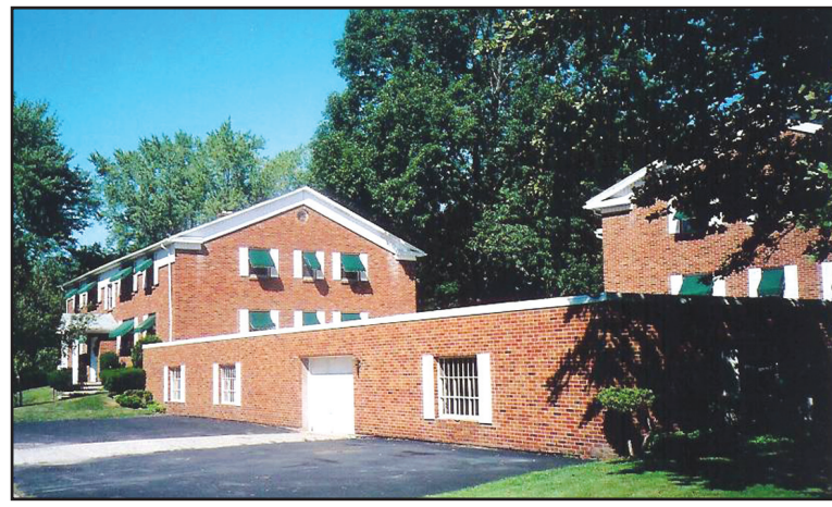
The Garrison Apartments, Amherst

active apartment markets in western New York and the center of suburban business activity. These large apartments feature separate heat and electric tenant utilities, balconies, landscaped grounds, and attached drive in parking garages.